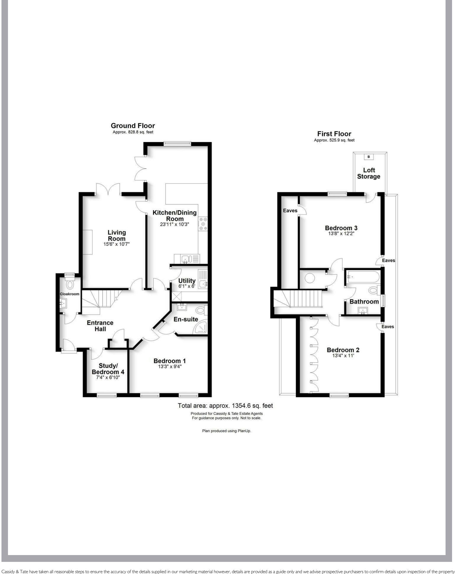
Cassidy & Tate naive taken all reasonable steps to ensure the accuracy of the details supplied in our marketing material nowever, details are provided as a guide only and we advise prospective purchasers to confirm details upon inspection of the proper Cassidy & Tate will not be held liable for any costs which are incurred as a result of discrepancies.